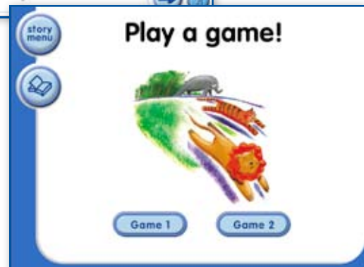
The Giant of the Sky enrichment portal page