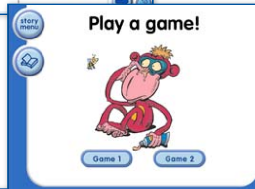
Charlie Chimpanzee enrichment portal page